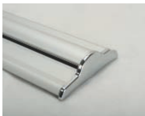
NEW STYLE BASE