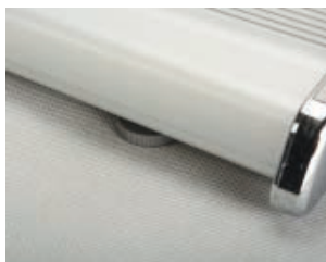
ADJUSTABLE FEET (for un level floors)