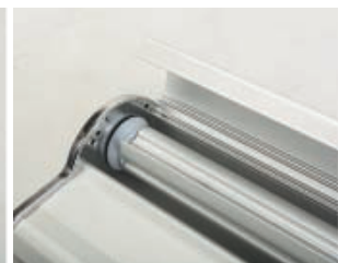
EASY CHANGE GRAPHICS