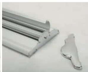
CHROME END CAPS