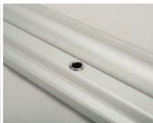
REINFORCE POLE SUPPORT