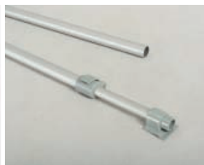
ADJUSTABLE POLE 1600-2200mm