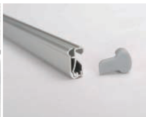
EASY FIT TOP BAR